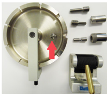
Items included with the TP-10

The bottom fixture has an eccentrically mounted, self-tightening knurled roller which accepts wire diameters up to 3 mm (0.13 in).